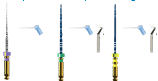
Slider 016.002v FX 035.012v FXL 050.010v

* SmartLite® Pro EndoActivator® coming soon