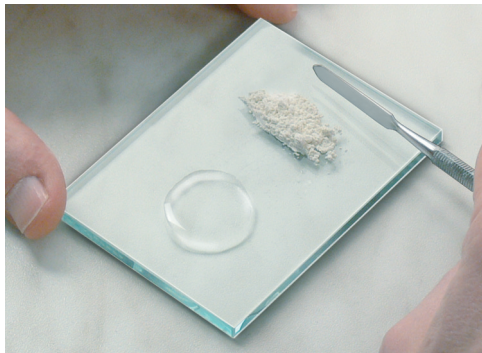
Dispense on a clean, dry glass plate at approx. 20°C (68°F).