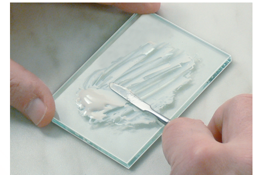
Ready-for-use mixture within 90 sec.