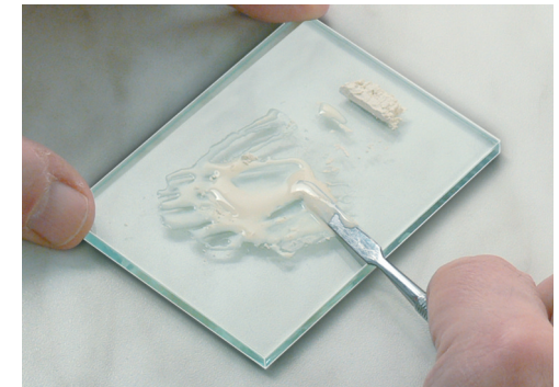
Mix with pressure and flat spatula within the next 30 sec.