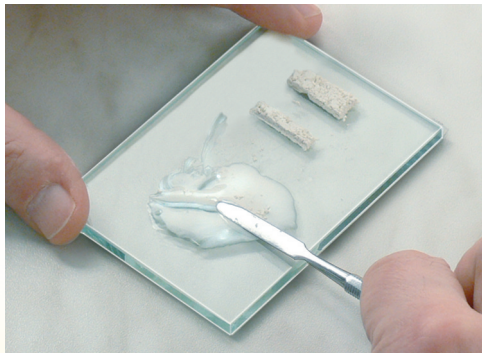
Second 1/8 within additional 15 sec., mix with spreading movements.