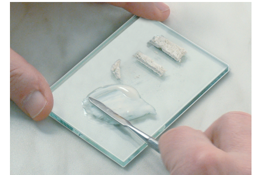
Mixing: Start with first 1/8 within 15 sec.