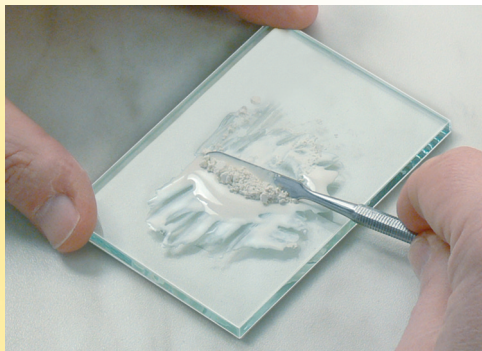
Mix remaining 1/2 within further 30 sec.