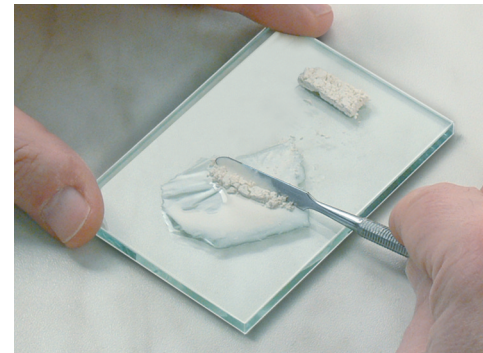
Draw 1/4 into the mixture.