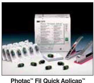
Photac<sup>™</sup> Fil Quick Aplicap<sup>™</sup> Introductory Kit (61000)