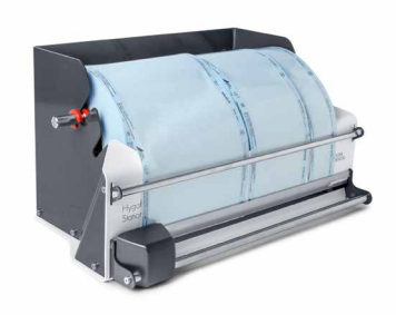
Hygofol Station, wall-mounted