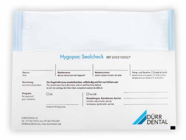
Hygopac Sealcheck, daily seam sealing test

The Hygopac View is the new generation of the Hygopac Plus rotary sealing device.