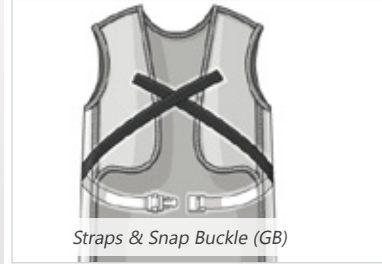
Straps & Snap Buckle (GB)