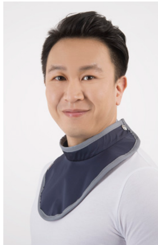
Loops on the back allow easy attachment to the dentist's chair.