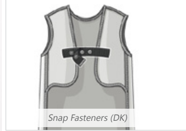
Snap Fasteners (DK)