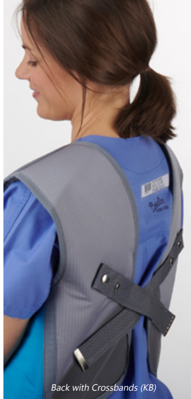
Back with Crossbands (KB)