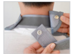
With interchangeable hook-and-loop fastener