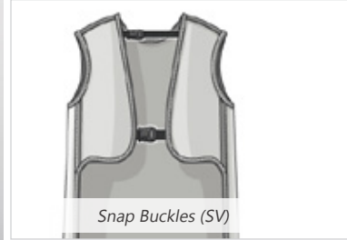
Snap Buckles (SV)